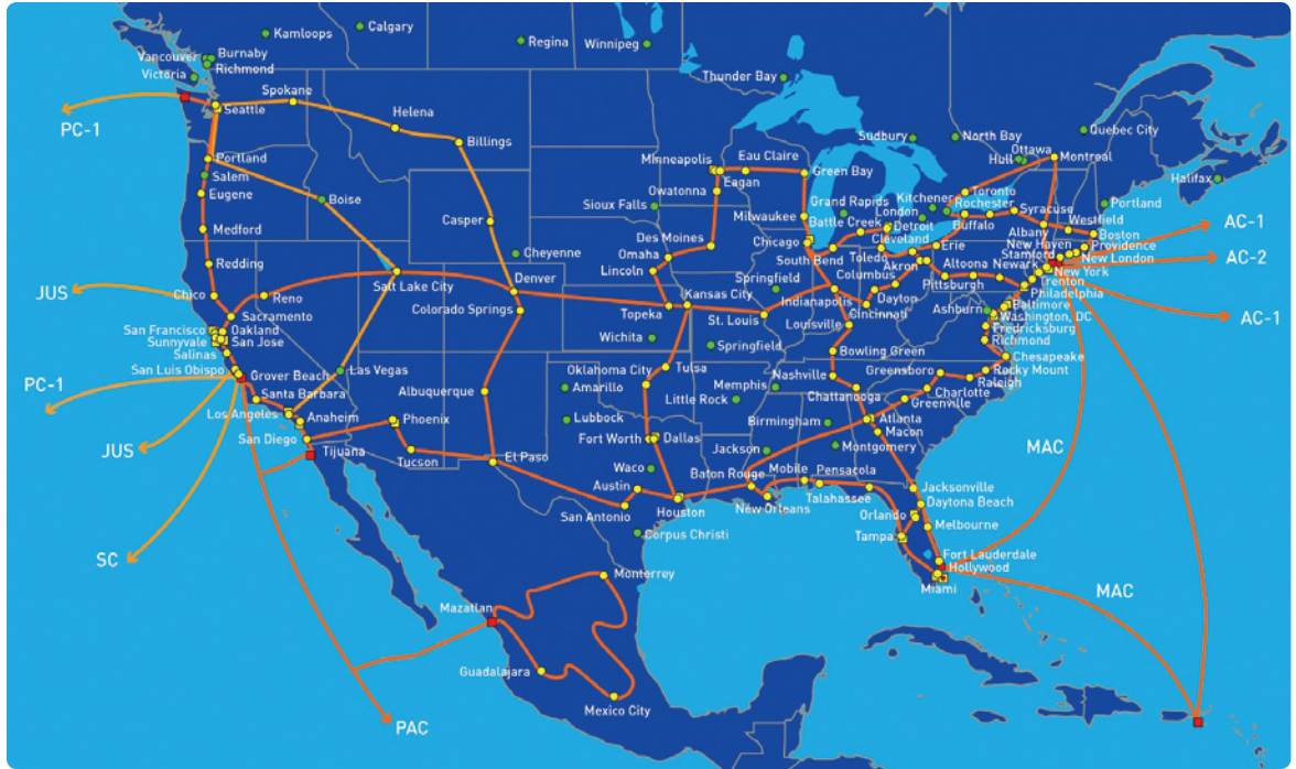
① Net Extended Reach connects all your locations nationally and internationally

Utilize your additional locations to achieve shared, redundant and failure-resistant Internet access.