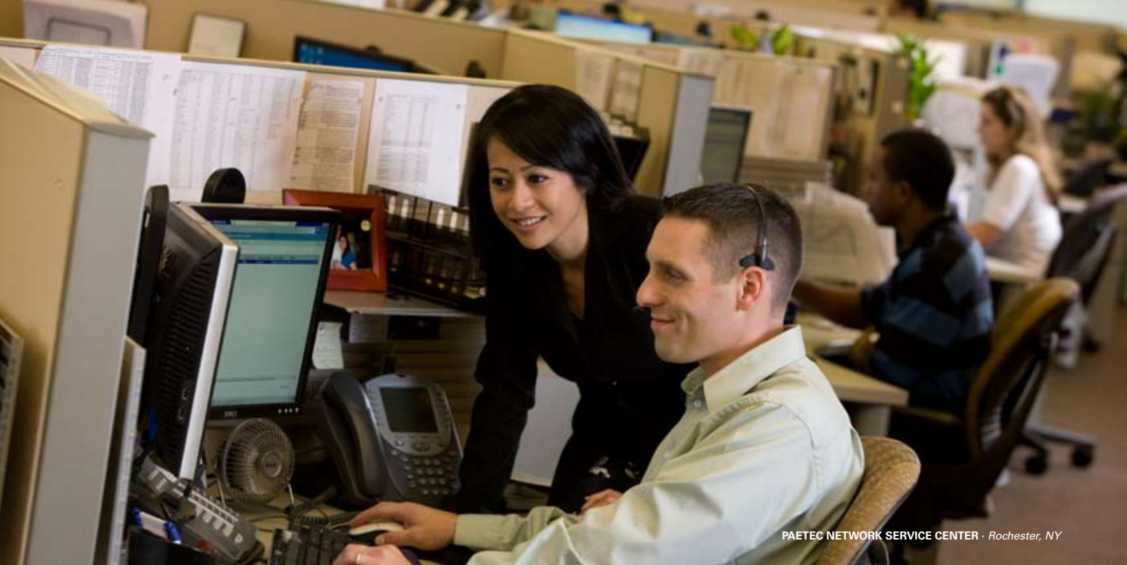
PAETEC NETWORK SERVICE CENTER - Rochester, NY